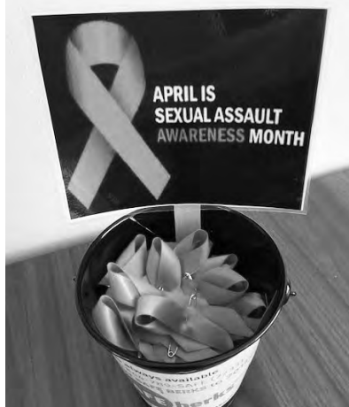
Safe Berks staff delivered thousands of teal ribbons, along with information about our free services for survivors, as part of Sexual Assault Awareness Month. We were honored to see advocates wearing these teal ribbons in hospitals and medical offices, in restaurants and shops, and at special events throughout Berks County. Staff also distributed thousands of coffee sleeves with information about SAAM to local coffee shops. These efforts encourage conversations, and every positive conversation helps end the stigma which has surrounded sexual violence. Ending the stigma surrounding sexual violence will help more survivors seek support. Discussion and awareness will also lead to the prevention of these crimes.