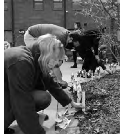
To kickoff Sexual Assault Awareness Month (SAAM), Safe Berks staff planted 250 pinwheels outside our Chestnut Street location at a special event called "Recognizing & Remembering Victims of Sexual Assault – Known & Unknown." These pinwheels symbolize local sexual assault survivors and our dedication to support them. Staff also participated in a training and discussion about issues of sexual violence in the military, and efforts to support survivors and end these crimes.